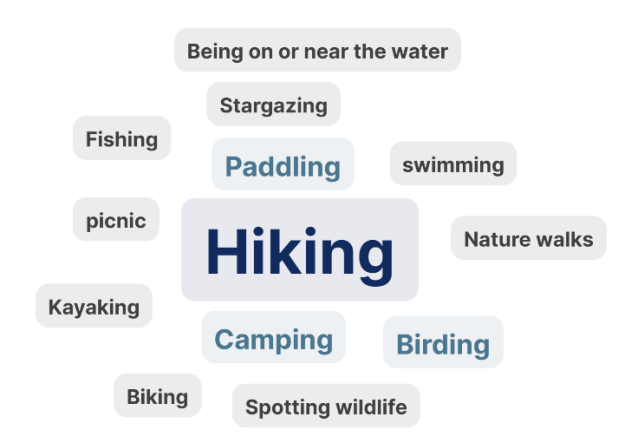
Figure 1: Favorite Recreation Activities