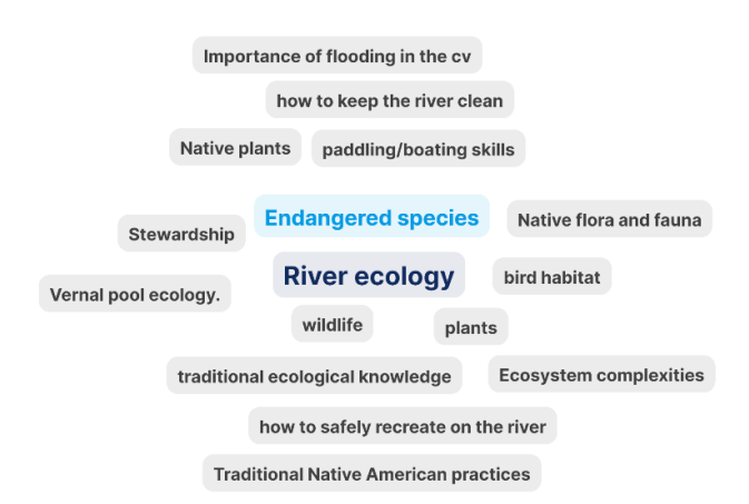
Figure 2: Educational Topics Attendees Would Like to See