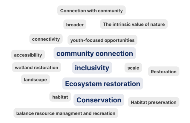
Figure 3: Core Values to Include